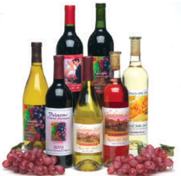
Wine Bottle Labels

The LX810 produces gorgeous, professional-quality labels for all your short-run, specialty products. It is also perfect for a host of other uses such as proofing before going to press on longer runs. Test marketing. Contract manufacturing. Private label goods. Promotional labels. Full-color box-end labels with all the required bar codes. And much more.