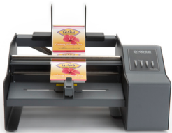
DX850 LABEL DISPENSER

are the perfect semi-automatic labeling solution for cylindrical containers as well as many tapered containers including bottles, cans, jars and tubes.